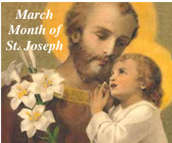
March Month of St. Joseph